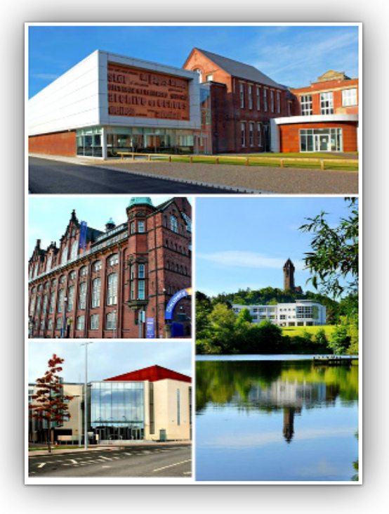
A snapshot of visited archives. From top to bottom: Gwent Archives, Tyne & Wear Archives, Stirling University & The Public Record Office of Northern Ireland

These are often within a local library or museum and are separate from the archives associated with the main clinical health bodies such as the NHS, Department of Health or Government Departments.