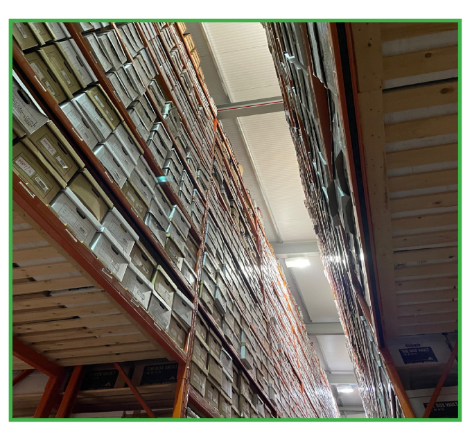
Boxes of files at an archive