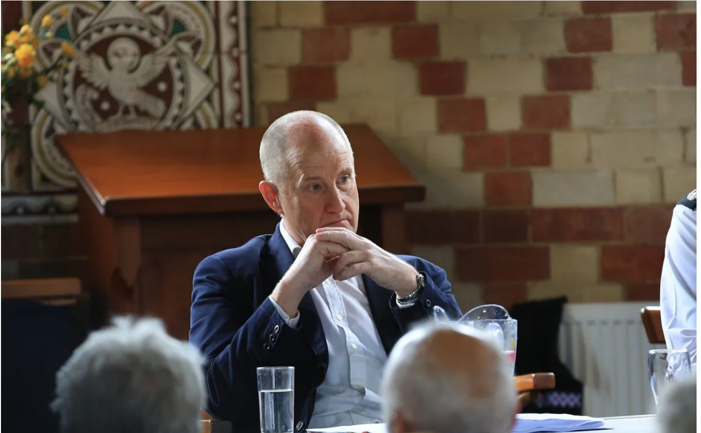
Business minister Kevin Hollinrake has demanded an immediate explanation of the bonus payments

Responding to an urgent question on the bonuses, Mr Hollinrake told the Commons: "The situation is extremely concerning and deeply regrettable and the Post Office is right to apologise."