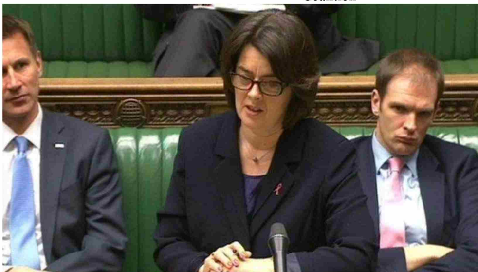
Jeremy Hunt – SoS