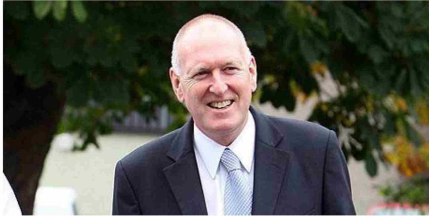
Paul Goggins 16 th June 1953 – 7 th January 2014