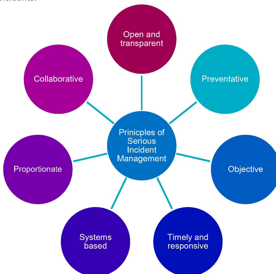
Figure 1: Principles of Serious Incident Management

This Framework endorses the application of 7 key principles in the management of all serious incidents: